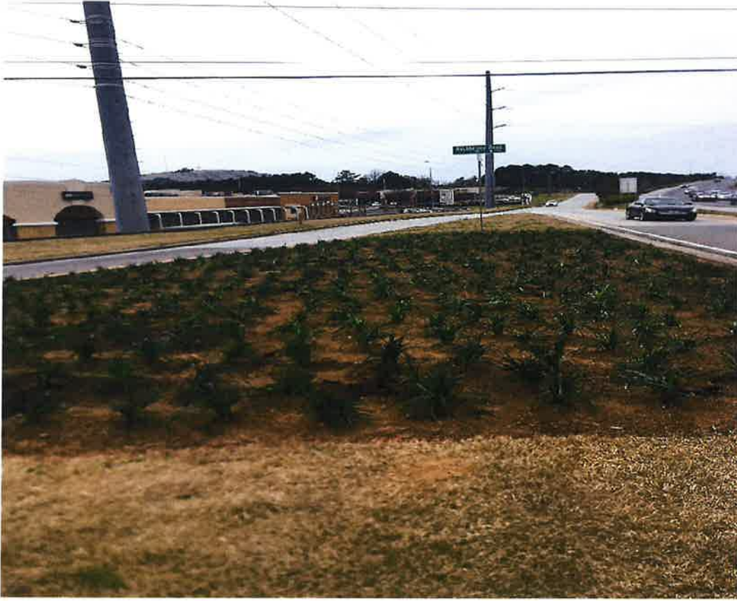
Triangle west of the Bank of America