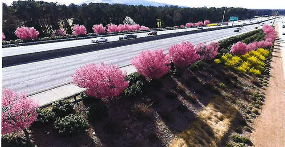
US 78 West quadrant