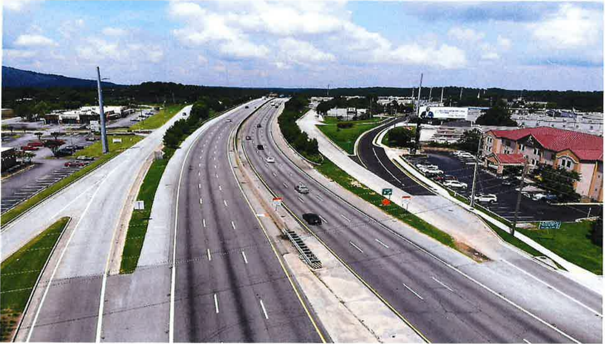
Overview of US 78 East and Westbound Lanes over the bridge, including the Triangle at Rockbridge Road (by storage building) and Island on W. Park Place Blvd-east of Marco's Pizza