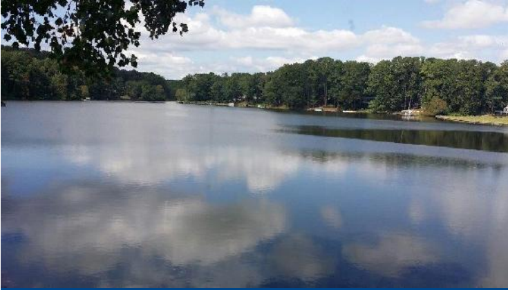
Beautiful views overlooking Lake Lucerne