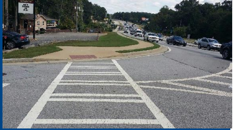
Curb cuts/sidewalks in place