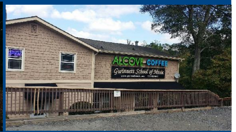
Shared ingress/egress with adjacent businesses Alcove Coffeehouse and Gwinnett School of Music