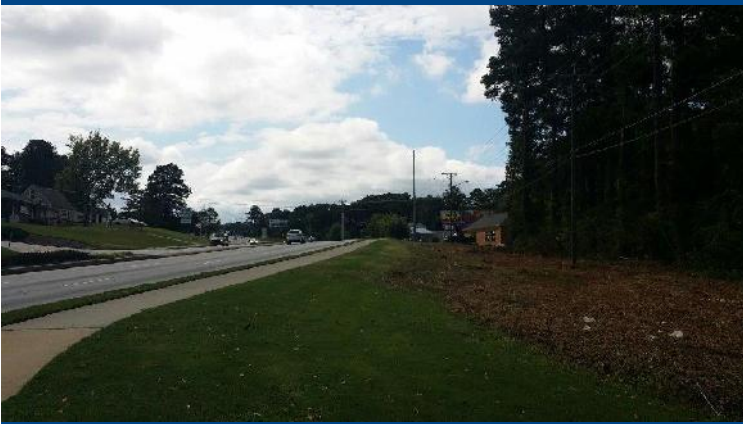
Traffic Count: +/- 60,000 vehicles per day on Stone Mountain Highway