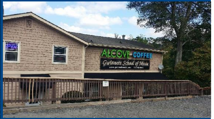
Shared ingress/egress with adjacent businesses Alcove Coffeehouse and Gwinnett School of Music